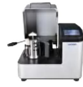
Planetary Ball Mill BM6PRO