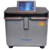
Cryo Grinder LM200