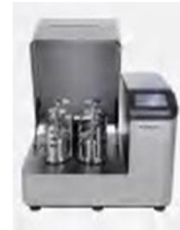
Planetary ball Mill BM40