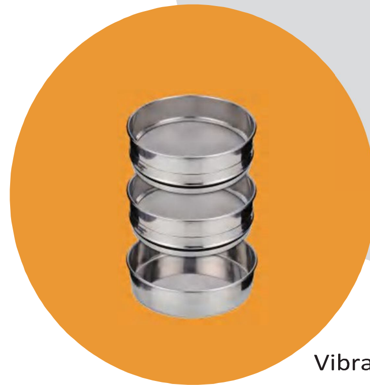
Vibratory Sieve Shaker SS2000

V S Equipments and Automations Pvt Ltd Bhoomi World Industrial Park, Building No: B/2, Gala No.: 3 Mumbai Nashik Highway NH/3, Pimpalas Village, Tehsil : Bhiwandi-421302. M:08169074358 +91 9833376434 E-mail:equipvs@gmail.com