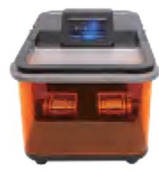
Micro Ball Mill GT300