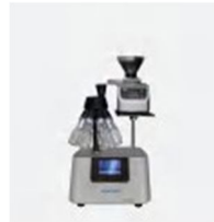
Sample Divider RSD 200