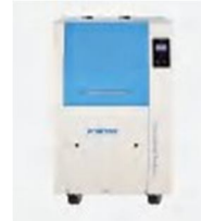
Vibratory Disc Mill VM3