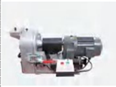
Disc Mill DP100