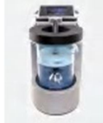
Knife Mill HM 300