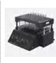
Smart Graphite Digester