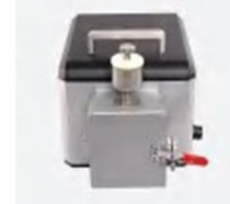
Portable Cutting mill CM50