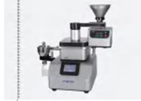
Ultra centrifugal Mill FM200